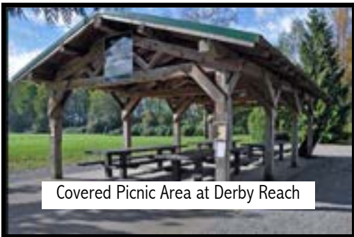
Covered Picnic Area at Derby Reach

Our "No Bell" Picnic was such a success for the past two years we have decided to do it again, this year. We will be welcoming our new retirees into the land of retirement. If you know of anyone who has recently retired, please mention our special event in their honour, as we do not always get contact information for them.