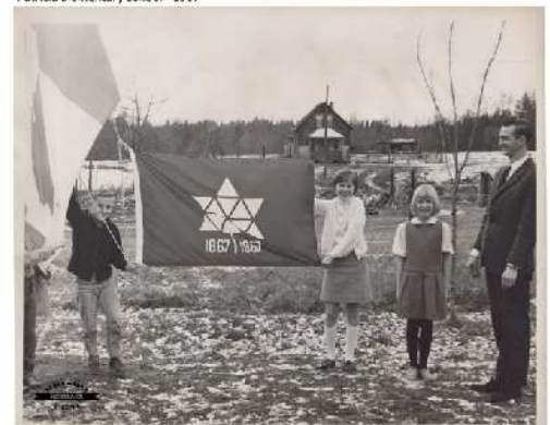
Patricia Elementary School - 1907