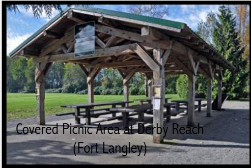
Covered Picnic Area at Derby Reach (Fort Langley)

It would appear that September will continue to be a challenge for us to get together to host our “No Bell” brunch, welcome new retirees to the LRTA, and to have our AGM. In the interest of safety for our members, we have arranged a “No Bell” picnic at Derby Reach on the outskirts of Fort Langley on September 8, 2020 from 11:00 - 2:00 p.m. It will be a BYOL (Bring your own lunch) event and you would bring your own folding chairs, and picnic items. We have reserved the covered area for the day and we will keep our fingers crossed for decent weather. Derby Reach is part of Metro Vancouver Regional Parks, located on the banks of the Fraser River, at 21801 Allard Crescent, Langley BC. There are picnic tables and outdoor washroom facilities available. We will not try to host a meeting at this picnic but hope you might like to join us for a social afternoon.