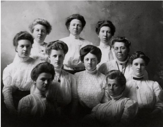
NW School Teachers - 1908

Newsletter of the New Westminster Retired Teachers January 2021