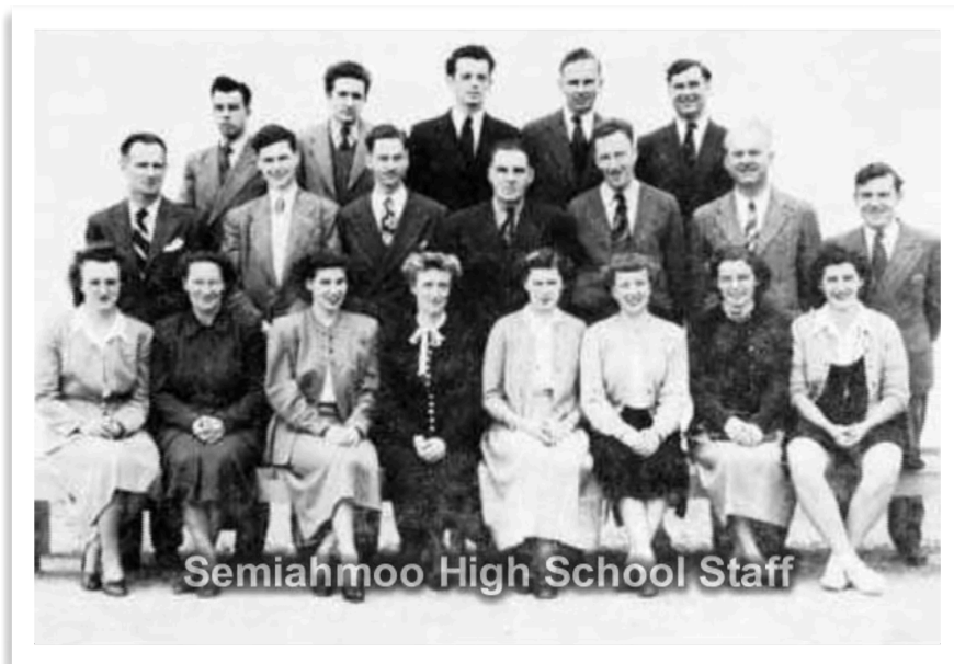
Semiahmoo High School Staff

Can you identify any of the teachers in this photo? It was taken at Semiahmoo Secondary taken in the 1950s.