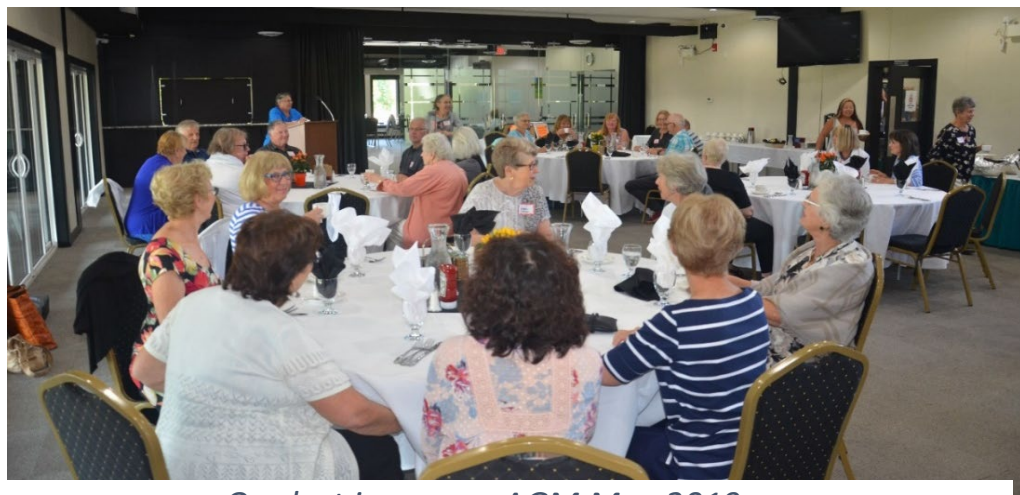
Our last in-person AGM May 2019