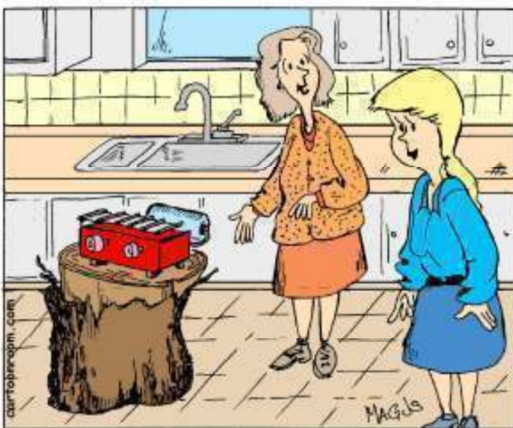
And then my husband said, 'I can easily put in a cooking island for you'.

Please note that we use the Burnaby School Board office as our mailing address. The Board office is in a new building on the old Schou site.