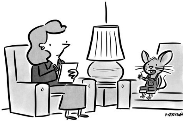
"I'm fine until someone gives me a cookie. Then all bets are off!"