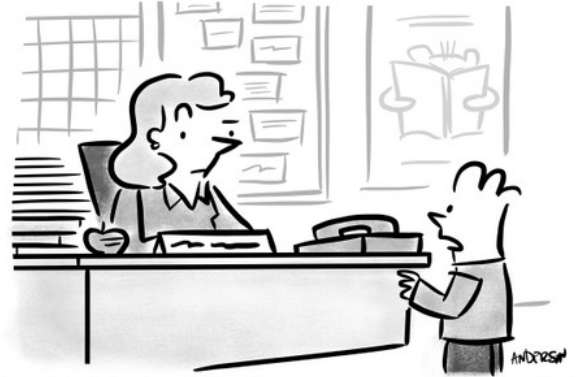
"How about instead of calling my mom we go old school and I just write a sentence on the board a bunch of times. You know, with handwriting getting such short shrift lately."