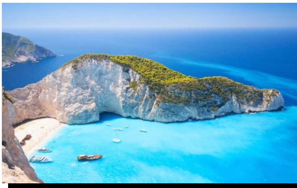
Navagio Bay Beach is one of the most spectacular beaches on Zakynthos, reported Lizette, with its crystal clear blue and turquoise waters and white sands.