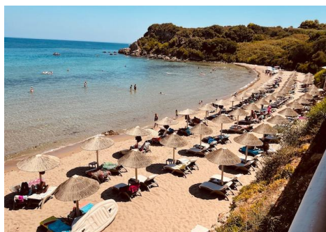
A packed beach on Zakynthos. "If you decide on a holiday to Greece you will not be disappointed, I guarantee it. Enjoy your summer wherever you are", says Lizette.