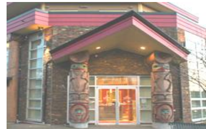
Lu'ma Native Housing Society