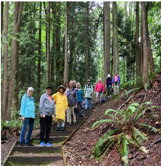
Right: Wednesday VRTA Walking group descend the ravine in Burnaby under some welcome rain in August.