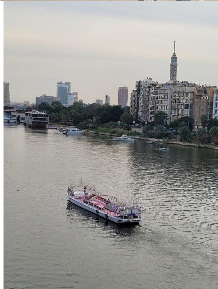
A tourist boat cruises down the river Nile in central Cairo.