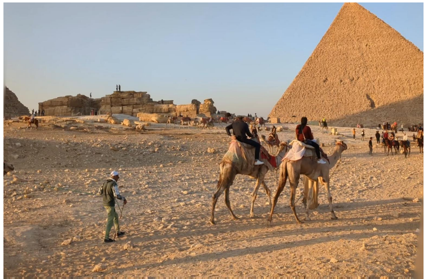
Tourists on camels and merchants stride across the Giza plain as the sun starts to set in Egypt.