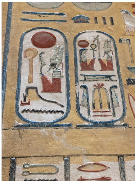
These colourful hieroglyphics were well preserved inside the walls of this temple.