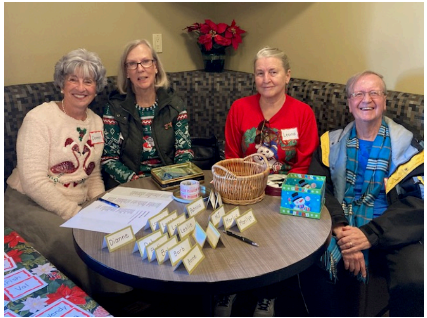
Christmas Luncheon Photos!