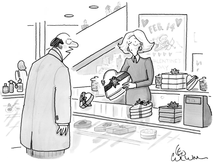
"I won't need a bag. I'll eat it here."