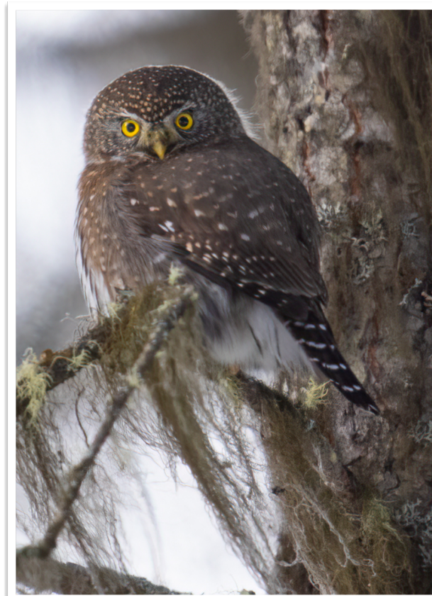
Northern Pygmy Owl