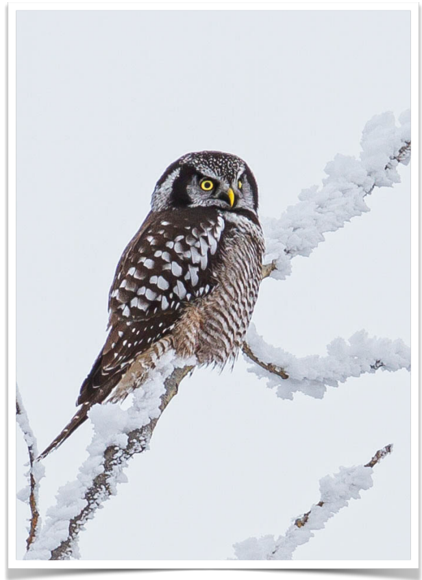
Northern Hawk Owl