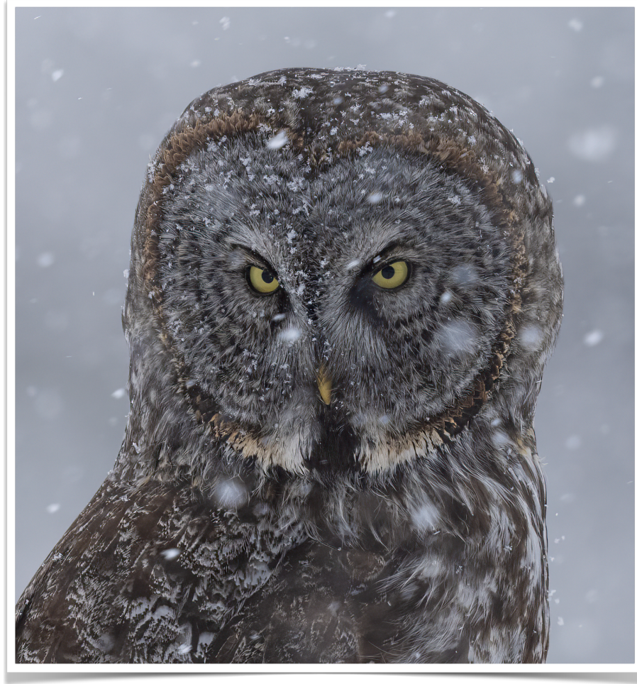
Great Grey Owl