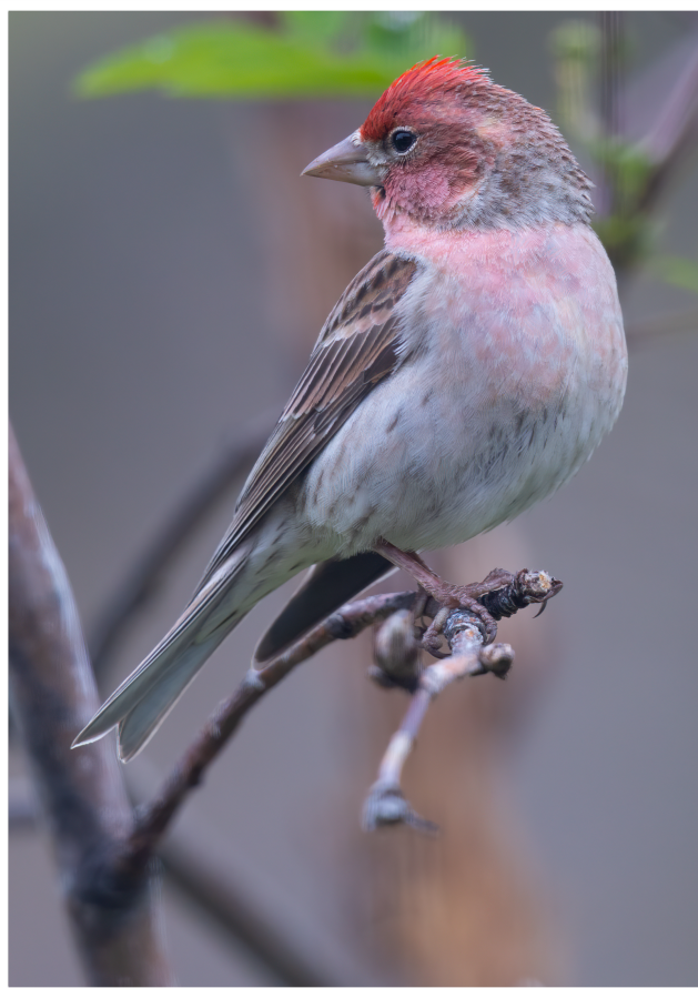
Cassin's Finch