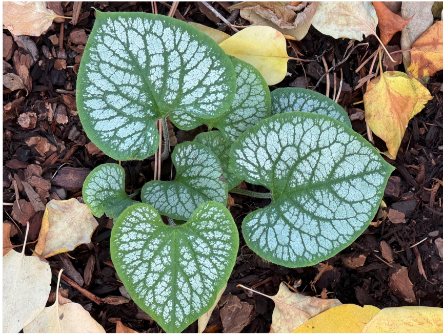
Brunnera Jack Frost