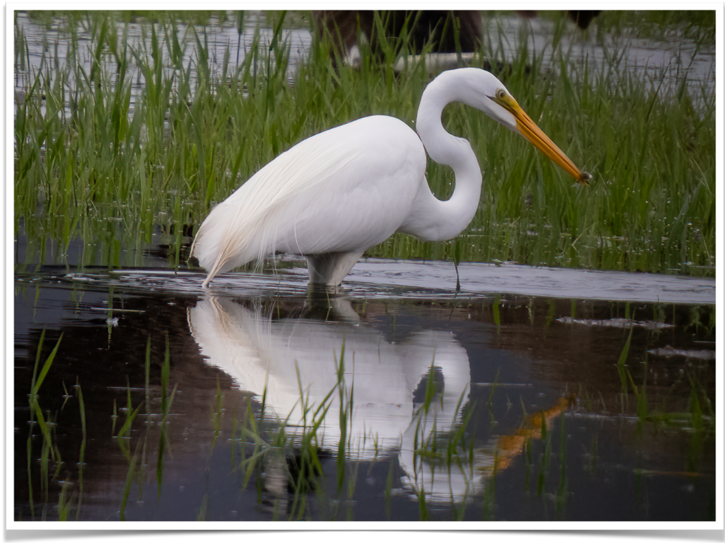
Great Egret