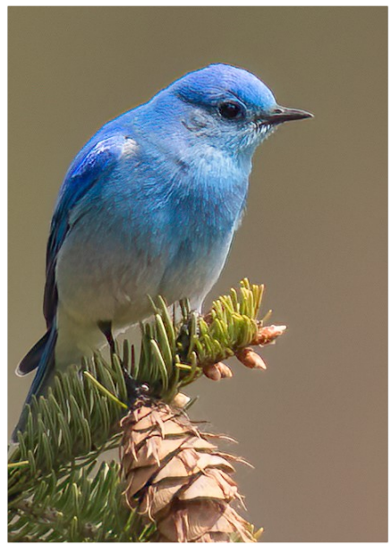
Mountain Bluebird