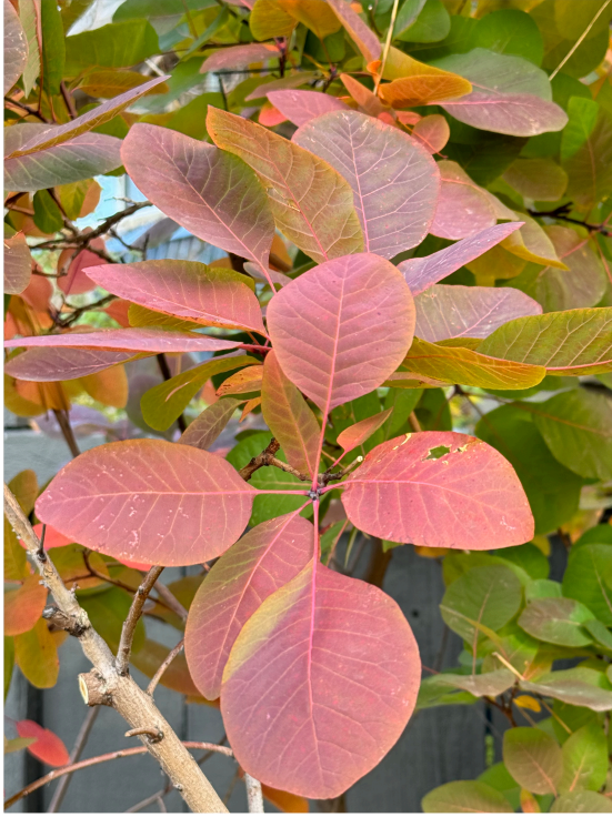
Smokebush in Fall

Bursary. This year the KTRT Club also gave to other charities including: The Peace Walk, the Ukrainian support group, the Canadian Harambee Education Society and Hospice.