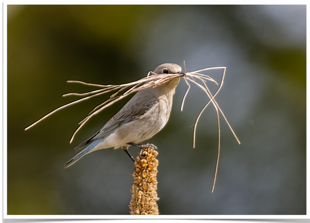
Mountain Bluebird