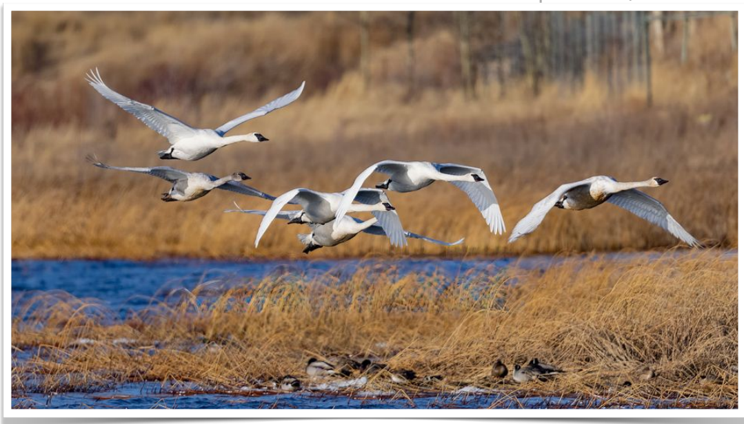
Trumpeter Swans