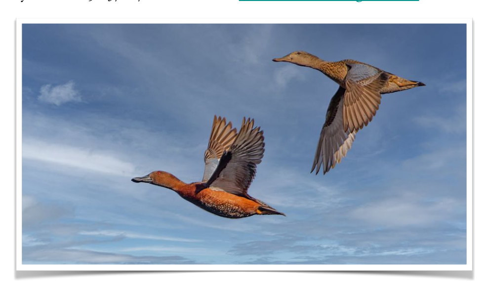
Cinnon Teals