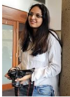
OJ at Langara Golf Clubhouse waiting for that perfect photo opportunity!