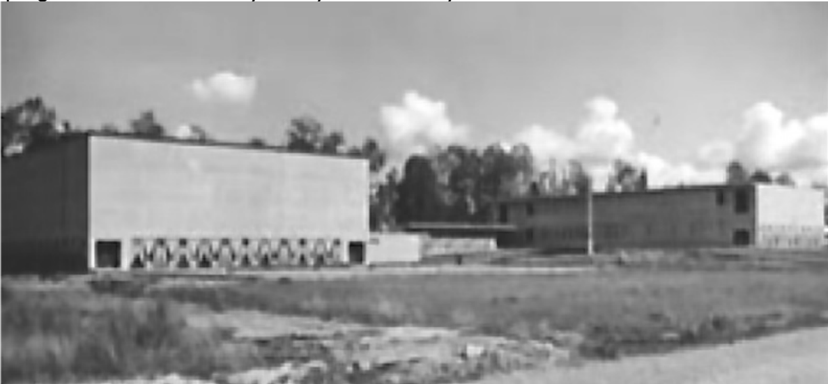
Guildford Park Junior High (formerly Mary Jane Shannon Junior High) was the first Community School in Surrey.

Unfortunately by the mid-1980s with increased budget concerns, the Surrey School District was forced to abandon the Community School program but its spirit has remained. Daycare, lunch programs, clothing drives and other community support programs are active in many Surrey schools today.