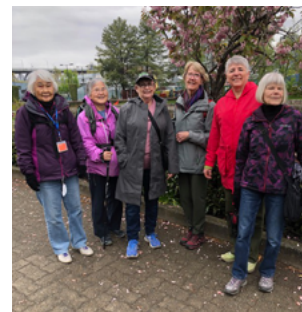
VRTA walking group