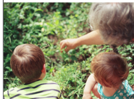
Image of a senior and two children looking at foliage.