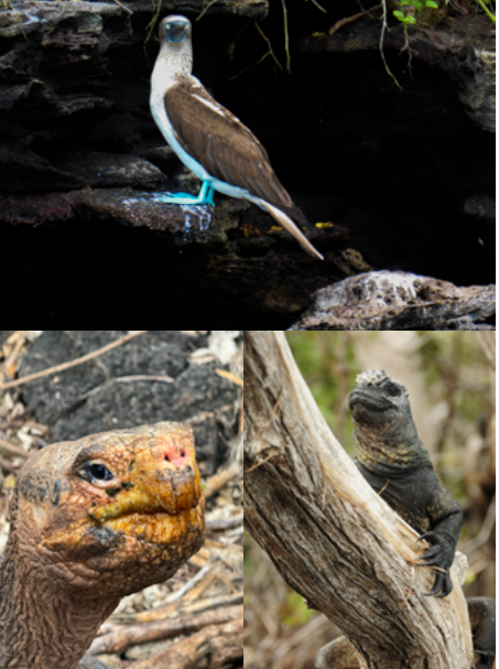
Blue-footed Booby, Sea Turtle & Marine Iguana

The next day, we visited Fernandina Island, the youngest and most volcanically active island in the Galapagos. We snorkelled in the clear water, where we encountered sea turtles, sea lions, marine iguanas, and penguins<sup>3</sup>. I was surprised to see penguins in such a warm climate, but I learned that they are the only species of penguin to live in the tropics. They survive by feeding on cold-water Antarctic currents that bring rich nutrients to the surface<sup>4</sup>. I remember floating over a cloud of thousands of silvery sardines as a small penguin shot through the school's midst like a torpedo!