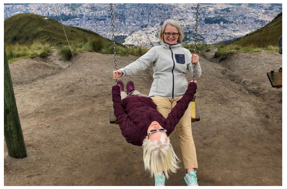
14000 feet on a swing above Quito, Ecuador

As a retired Culinary Arts instructor, I have always been fascinated by the diversity of food, culture and ecology around the world. A friend and I (who was my Fashion Design instructor for my Bachelor of Design in Fashion & Technology degree from Kwantlen Polytechnic University) decided