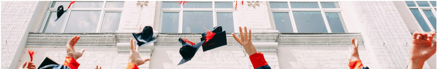
Image of students throwing graduation cap into the air

Note: The Friends of the Vancouver Retired Teachers' Association is the charity "arm" of the VRTA. Following CRA regulations, the Friends are a separate organization that has its own Annual General Meeting. When you give to the scholarship fund, you give to the Friends (FOVRTA—Vancity Community/RRSmith Fund) and not the VRTA. All Members of the VRTA are members of the Friends of VRTA