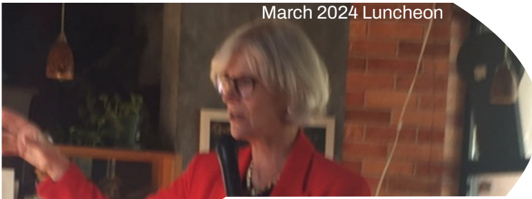
March 2024 Luncheon