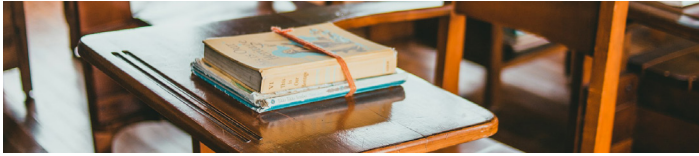
Image of school desk and books