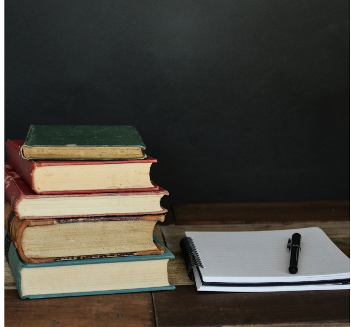
Image of stack of books and notebook