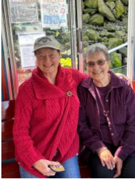
New friendships were formed

It was a smaller-than-anticipated group due to last-minute health issues, but we got lucky with the weather (again), enjoyed a delicious lunch (some with wine!) and those of us who did attend had fun (which was the whole point!).