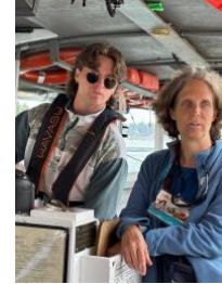
the Captain and 1st mate kept us safe

So I will be taking a break from planning Just for Fun activities for PQRTA, as my summer will already be chock-a-block full of fun activities like camping in Penticton with my sister and taking an old friend from Germany on an action-packed tour through B.C., from Parksville & Tofino to the Rocky Mountains, and ending up walking on fossils in Dinosaur Provincial Park in Alberta, before she flies from Calgary to her next destination on her very first trip to North America. So looking forward to it!