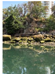
Scenery was admired