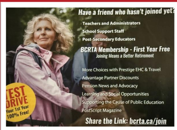
Always looking for new members. See link: Join • BC Retired Teachers' Association