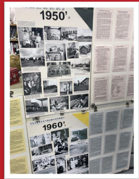
Displays at the Prince George Heritage Centre highlighting education throughout the past century