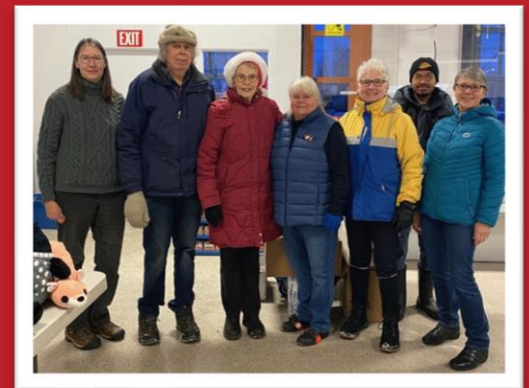
Using a twist on the Advent Calendar, boxes of food items were collected by TDRTA members and taken to The Garage Food Bank