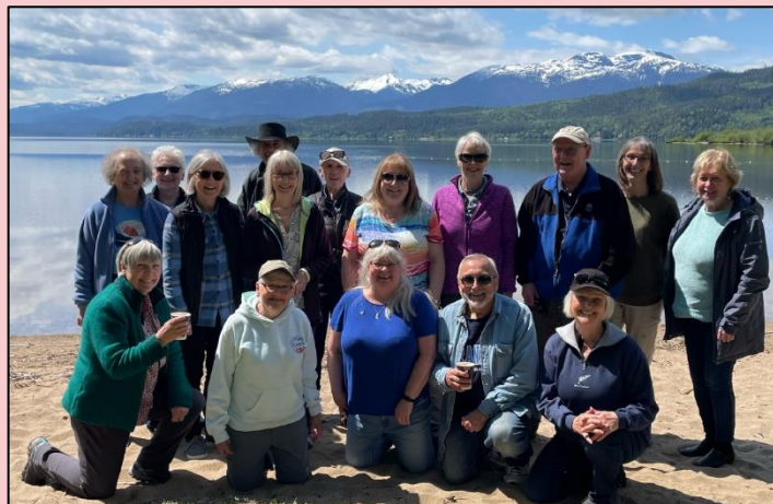
TDRTA and KRTA June 2025 picnic