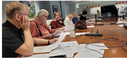
ABOVE There is always items to be discussed in detail before the executive makes its decision.

The group met on the second floor of the BCTF building to plan events and make improvements over how we manage various issues and concerns. The meeting lasted an extra 15 minutes due to an unexpected Earthquake drill!