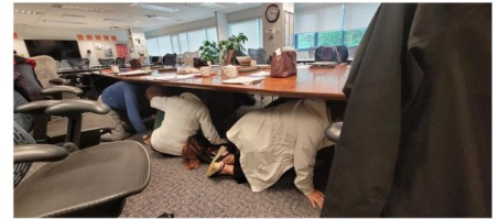
ABOVE: Being "forever a school teacher", executive members took the earthquake drill seriously and sheltered undercover while one of us counted out 2 minutes! Fortunately, there were no shock waves.