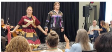
Thursday evening included Advantage partners' vendor displays and the opportunity to dance with these two folk dance leaders. And we did!

Three members of the VRTA attended this convention Sunday Oct. 5 to Tuesday Oct. 7 at the Airport Executive Hotel in Richmond. This was a smaller gathering than the COSCO one but still rich with speakers, discussion, networking and the consideration of serious resolutions to prod the federal government to act. See photo above of all the delegates. https://nationalpensionersfederation.ca/convention/