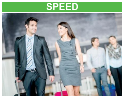
24/7 shuttle bus