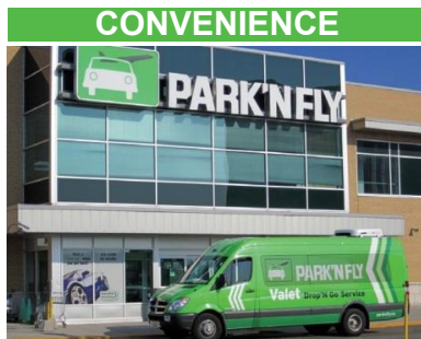
Minutes to airport terminal