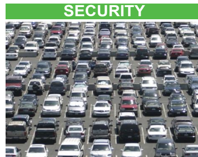
Well lit, secured lots

Now available to all BCRTA Members — take advantage of these great savings. Park'N Fly's "Best Value" in Airport Parking can be used for business or personal travel.