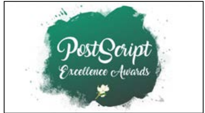
TOPIC: Celebrating BCRTA's Magazine