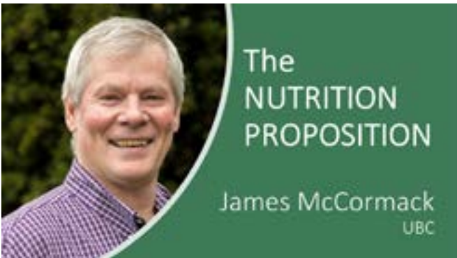
TOPIC: Nutrition Science