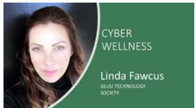
TOPIC: Tech for Retirees