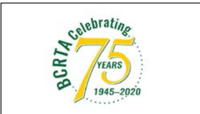
TOPIC: BCRTA History