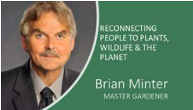
TOPIC: Environment and Well-being