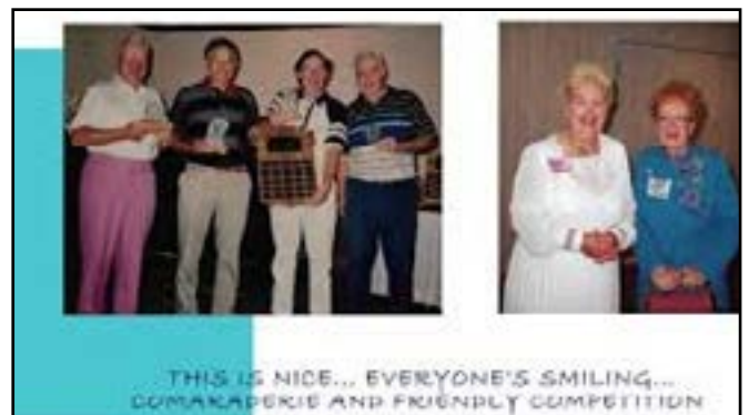
TOPIC: Faces From the Past